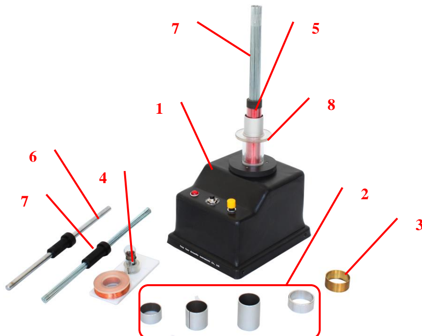
Picture of the ring launcher instrument